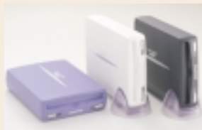
Magneto-optical (MO) disk drive