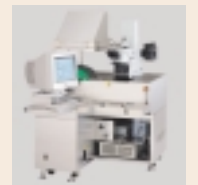
Semiconductor inspection equipment