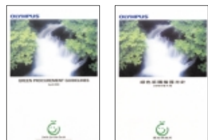
Olympus "GREEN PROCUREMENT GUIDELINES" (left: English version, right: Chinese version)

Green procurement of parts and components from not only the Japanese market but also from overseas is encouraged, and the Company prepared an English version of the Olympus "GREEN PROCUREMENT GUIDELINES" in May 2001. The Chinese version was prepared in March 2002. The publications provided the business partners with a clearer explanation of the green procurement policy.