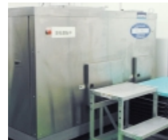
Composting Unit for Food Waste (Technology Research Institute)

A waste recycling center has been constructed within the Technology Research Institute located in Hachioji City, Tokyo, and started operation from March 2002. The recycling center will mean better separation and recycling of food waste.