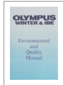
Environment and Quality Control Manuals of OWI