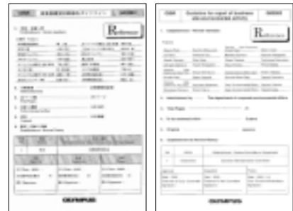
Front Cover of Standard Documents (left: Japanese version, right: English version)

The revisions also conform to the international standard ISO14031, an environmental performance indicator.