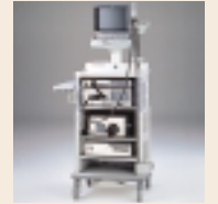
Endoscopic videoscope system