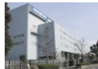
Olympus Logitex Co., Ltd., Tokyo Center

The Tokyo Center in Kawasaki City, which combines the distribution centers of Olympus Logitex, the company responsible for distribution in the Olympus Group, went into full-scale operation from August 2001. This means a substantially faster distribution time and a shorter distance for transfer of products and parts.