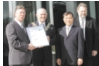
KM Certificate and Parties Concerned

ISO14001 environmental management system certification was obtained by Olympus Winter & Ibe GmbH (OWI) in May 2001 and in KeyMed (Medical & Industrial Equipment) Limited (KM) in March 2002, both overseas production centers.