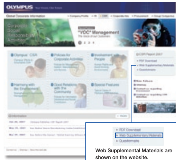
Web Supplemental Materials are shown on the website.