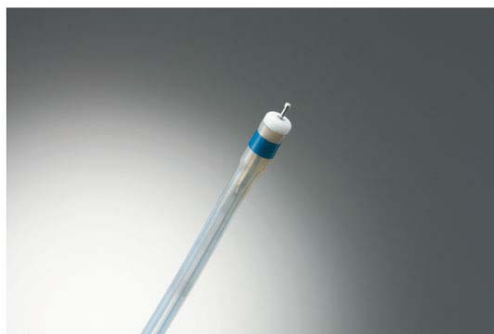
Electrosurgical Knife for ESD

* Prev. forecast: Consolidated earnings forecast released on August 1, 2008