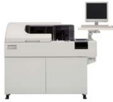
Automated Chemistry Analyzer