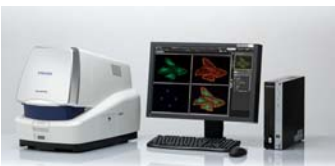
Box-Type Fluorescence Imaging Device

* Prev. forecast = the consolidated earnings forecast released on August 1, 2008