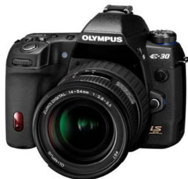
Digital SLR Camera E-30

* Prev. forecast = the consolidated earnings forecast released on August 1, 2008