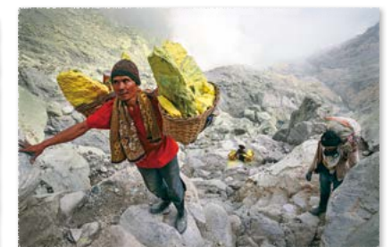
Work by fiscal 2016 participants