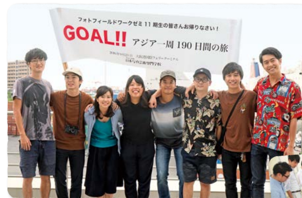
Students who returned from a six-month tour of Asia