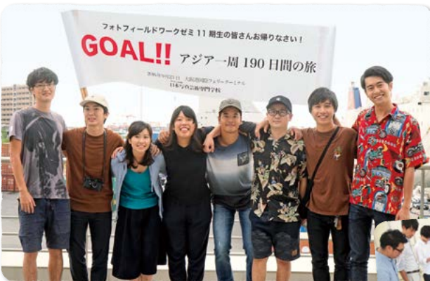
Students who returned from a six-month tour of Asia