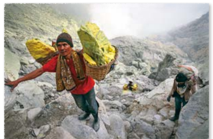
Work by fiscal 2016 participants