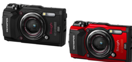
Compact Digital Camera TG-5