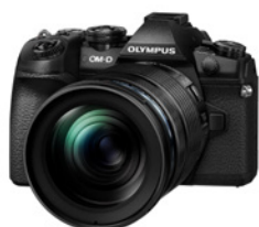
Interchangeable Lens Camera OM-D E-M1 Mark II TG-5

Audio recorders, linear PCM audio recorders, binoculars