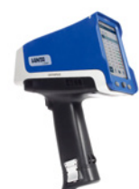
Handheld X-ray fluorescence analyzers