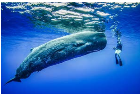
Kaigo no Shunkan