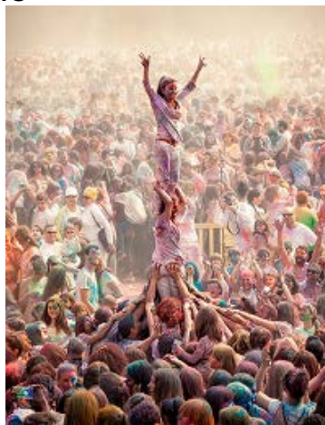
Castellers en el Holi