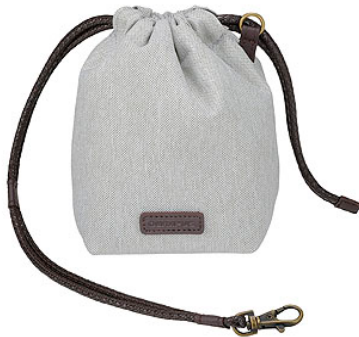
New Lens Case, CS-52

This is a compact lens case for storing interchangeable lenses and will be released together with the Olympus PEN E-PL9. The case features design details such as a grainy cloth and antiqued style metal clasps. The hand strap can be looped over your wrist so you can keep both hands free when changing lenses. This case is designed for functionality as well, and the mounting bracket can be hung on the handle of a bag so that you can easily find it when the lens case is in your bag. Lenses that can be stored in the case include the M.Zuiko Digital ED 14-42mm F3.5-5.6 EZ, M.Zuiko Digital 45mm F1.8, M.Zuiko Digital 25mm F1.8, M.Zuiko Digital ED 30mm F3.5 Macro, M.Zuiko Digital ED 40-150mm F4.0-5.6 R, etc. See the Olympus Website for further details.