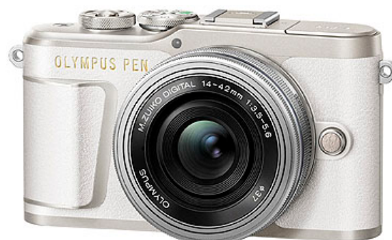
Olympus PEN E-PL9 14-42mm EZ Lens Kit Body (White) + M.Zuiko Digital ED 14-42mm F3.5-5.6 EZ