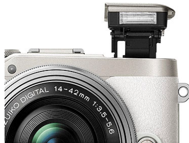
Built-in flash in use