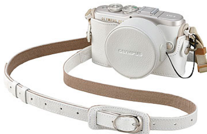
Genuine Leather Jacket CS-45B + Genuine Leather Shoulder Strap CSS-S109LL II + Genuine Leather Lens Cover LC-60.5GL

This genuine leather body jacket is designed to protect the camera body from scratches and to expand possibilities for coordinating with other fashions. It is designed for use with the Olympus PEN E-PL7, E-PL8, and E-PL9, and is available in white, black, brown, and light brown. You can also enjoy coordinating the jacket with the currently available Genuine Leather Shoulder Strap CSS-S109LL II and Genuine Leather Lens Cover LC60.5GL.