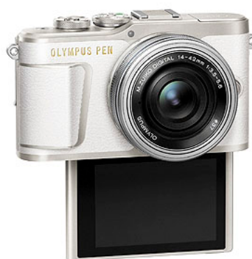
The flip down monitor