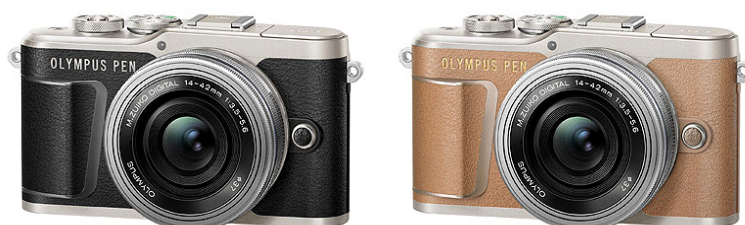
Olympus PEN E-PL9 14-42mm EZ Lens Kit Body (Black/Brown) + M.Zuiko Digital ED 14-42mm F3.5-5.6 EZ