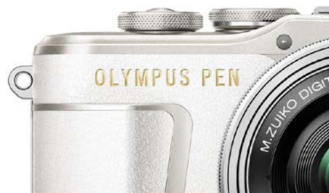
A sophisticated design with foil stamping

This model is incredibly portable, and is lighter than a 500 ml bottle of water even when combined with the M.Zuiko Digital ED 14-42mm F3.5-5.6 EZ lens, making for a compact size that fits in the palm of your hand. The grip has been modified to achieve a shape that is easier to hold. Three body colors are available to match your style; white, black, and brown.