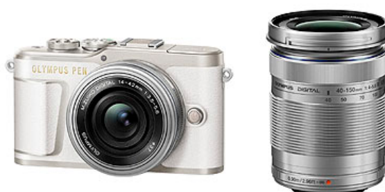
Olympus PEN E-PL9 EZ Double Zoom Kit Body (White) + M.Zuiko Digital ED 14-42mm F3.5-5.6 EZ + M.Zuiko Digital ED 40-150mm F4.0-5.6 R