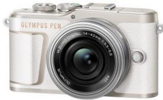
Olympus PEN E-PL10 14-42mm EZ Lens Kit Body (White) + M.Zuiko Digital ED 14-42mm F3.5-5.6 EZ