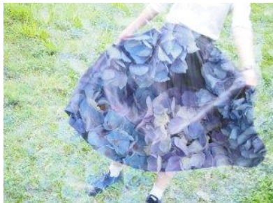
Multi Exposure image

AP mode provides shooting functions that generally require advanced photography techniques with simple operations. Anyone can easily shoot a multi-exposure photo by just overlapping two images in Multi Exposure, and shoot light trails of stars or automobile lamps without the risk of overexposure in Live Composite. Silent mode, which mutes shutter and operation sounds, is now possible in P, A, S and M modes as well as AP mode.