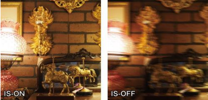
Image stabilization effects