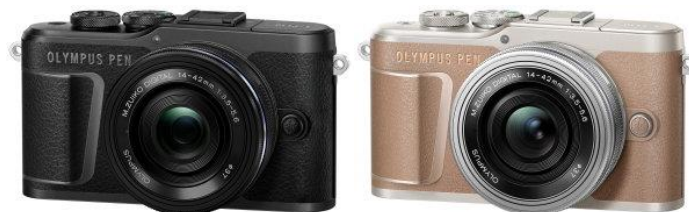
Olympus PEN E-PL10 14-42mm EZ Lens Kit Body (Black/Brown) + M.Zuiko Digital ED 14-42mm F3.5-5.6 EZ