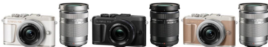
Olympus PEN E-PL10 EZ Double Zoom Kit Body (White/Black/Brown) + M.Zuiko Digital ED 14-42mm F3.5-5.6 EZ + M.Zuiko Digital ED 40-150mm F4.0-5.6 R