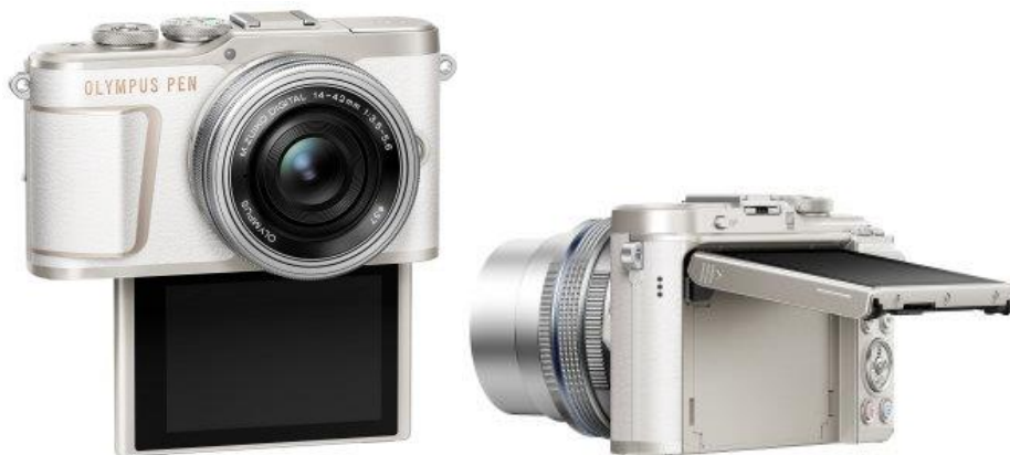
The flip-down LCD monitor in use

Simply touch the subject shown on the LCD monitor to simultaneously focus and activate the shutter (Touch AF Shutter). When the monitor is flipped down, it automatically switches the camera to Selfie mode for easy self-portrait shooting. You can also select e-Portrait for brighter, smoother skin, or switch to movie recording 3 with a simple touch operation. Changing the angle of the LCD monitor also makes it possible to shoot from various perspectives.