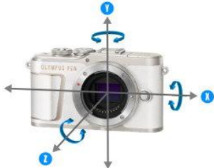
Image of in-body image stabilization

This model is equipped with in-body image stabilization 2 , powerfully suppressing camera shake, which tends to occur when shooting at night, in dim indoor scenes, while shooting video and when using a telephoto lens. It also features TruePic VIII, the same image processor found in Olympus' professional models, for clear images with minimal noise, even in low-light scenes. The combination of in-body image stabilization and TruePic VIII provides blur-free images.