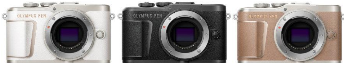
Olympus PEN E-PL10 Body (White/Black/ Brown)