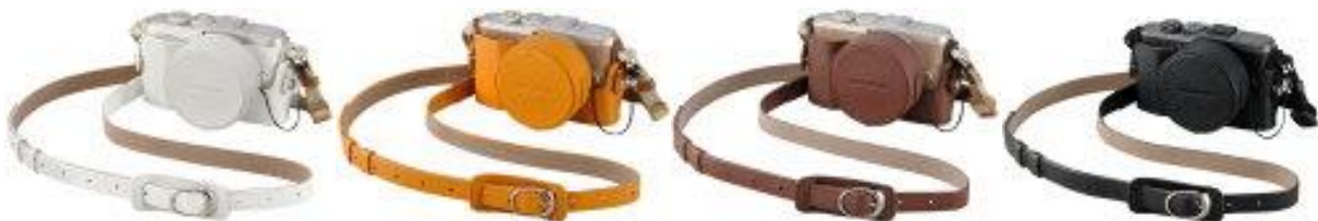
Genuine Leather Body Jacket CS-45B, Genuine Leather Shoulder Strap CSS-S109LL II, and Genuine Leather Lens Cover LC-60.5GL colors

These genuine leather accessories are designed to protect the camera and enhance its design. Available in white, black, brown, and light brown, so they are easy to match with any style.