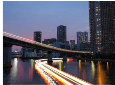
Live Composite image