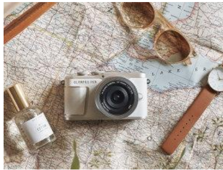
Simple, harmonious design

The E-PL10 is available in white, black, and brown. Each details of the colors of leather-feel materials and surface finish are carefully selected for exquisite texturing. This model is designed for a simple, harmonious look that is easy to match with any style. When paired with the M.Zuiko Digital ED 14-42mm F3.5-5.6 EZ standard kit lens, it is highly portable, and is lighter than a 500 ml bottle of water.