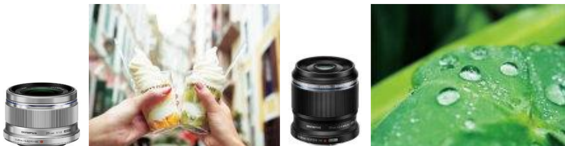
Image taken with M.Zuiko Digital 25mm F1.8

A versatile lineup of compact, lightweight, high-performance interchangeable lenses are available, including bright, single-focal-length lenses as well as macro lenses to achieve beautiful defocusing effects. You can choose the perfect lens depending on the subject to dramatically expand the possibilities of photographic expression.