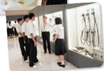
Photo courtesy of: Fukuoka Prefectural Kurate High School Hachioji Municipal Tate Elementary and Junior High School Fuchu Municipal Fuchu Dai-ni Junior High School